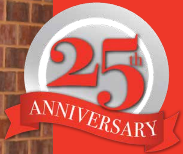
Earl Lazerson, SIUE president from 1979-93, addressed attendees during the CAS 25th Anniversary virtual celebration in June.