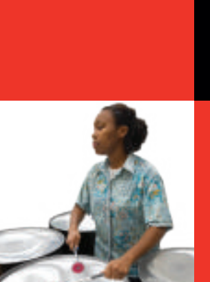
Southern Illinois University Edwardsville